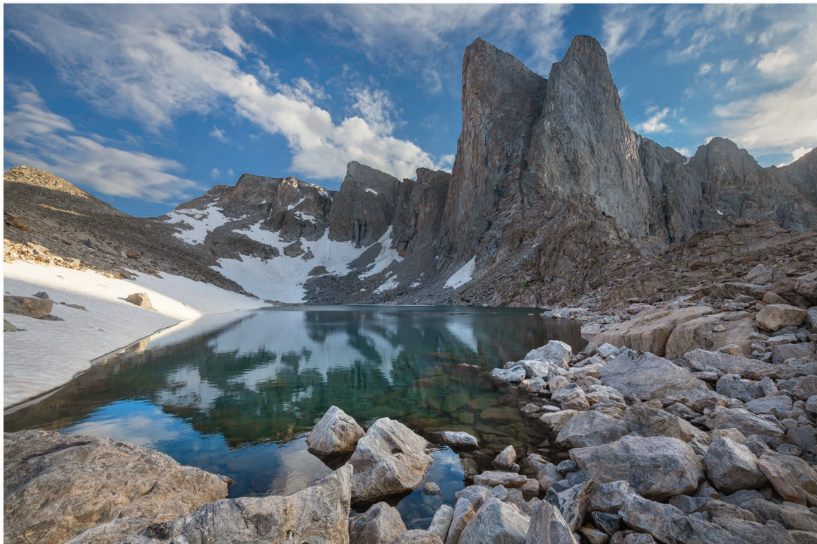
Pronghorn Peak, Lake Donna