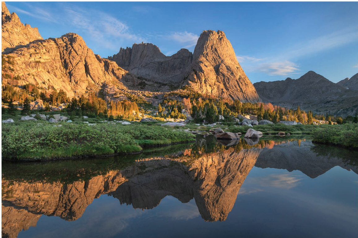
Pingora Peak, Cirque of the Towers